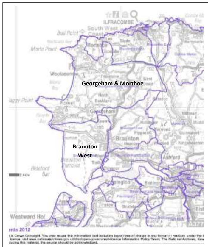
Figure 5.1 The Electoral Ward areas

The Surfing Beaches fall within the Electoral Wards of Branton West and Georgeham & Morthoe (G&M) (see Fig. 5.1). These two wards also encompass the nearby village communities of Woolacombe, Morte Point, Georgeham, Croyde and Branton (west part only). Socio-economic data highlight the key characteristics of these areas.